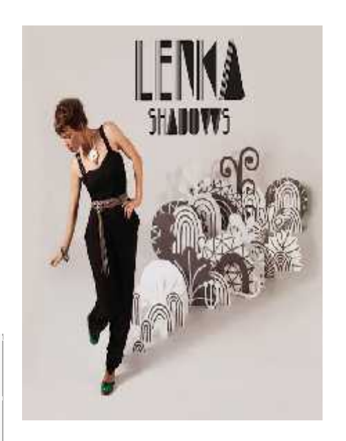
Shadows - Album