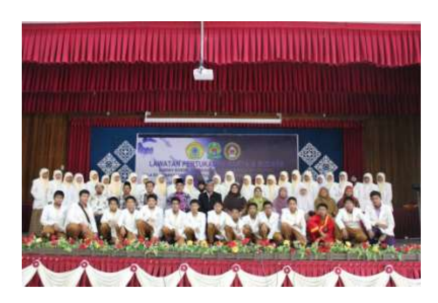
LawatanPertukaranKaryadanBudaya in Malaysia