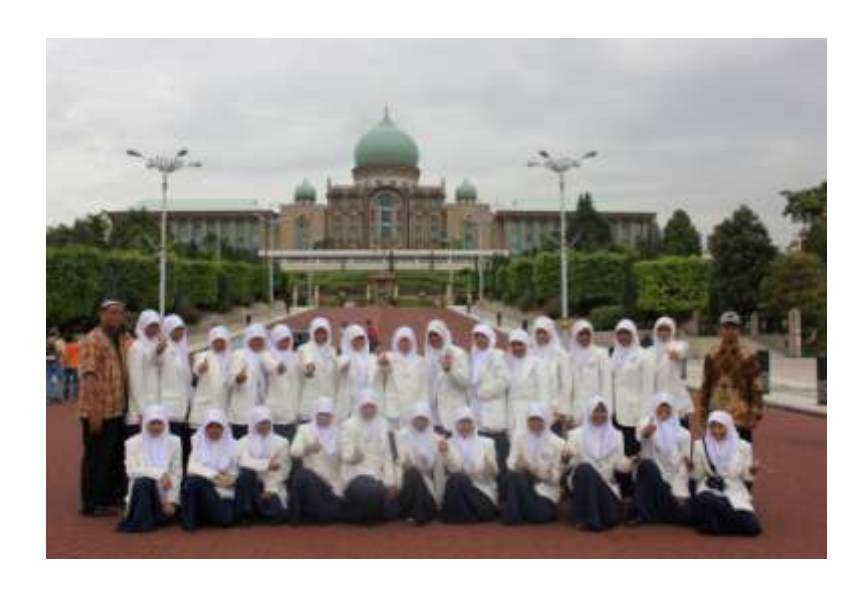
Student exchange in Malaysia