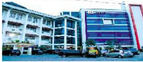
Fig. 2. Building And Parking Area With Lack Environment

Based on the scheme in the figure showed the relationship between economic, development, and environment that could not be separated and go hand in hand. But what was seen now, development was focused on a small part of the element of sustainable development.