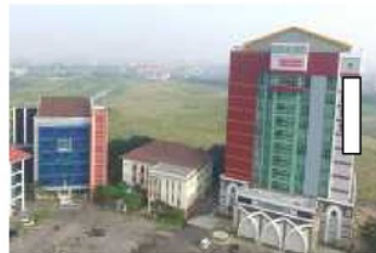
Fig. 3. Building And Parking Area With Lack Environment

Based on the picture, it appeared that parking as part of the design, was actually designed "just" and what it was. Supported by the procurement of trees without careful design. The trees that were actually provided will grow as expected after the next few years. However, there was still a need for design so as not to impress the "rest" of development and be the last concern.