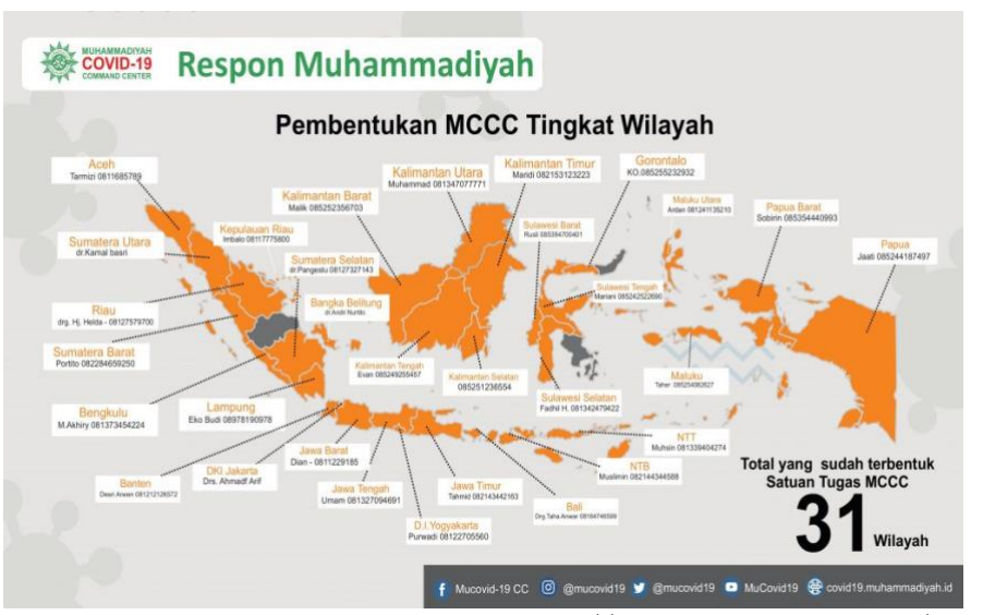
Figure 1. Muhammadiyah Responses

In the implementation of the work carried out, MCCC does not go alone, MCCC consists of the following elements: the Public Health Advisory Council (MPKU); Muhammadiyah Disaster Management Center (MDMC); 'Aisyiyah; LAZISMU; Council of Higher Education and Research Development (DIKTI LITBANG); Elementary and Secondary Education Council (DIKDASMEN); Tabligh Council; Muhammadiyah Student Association (IPM); Muhammadiyah Student Association (IPM); Muhammadiyah Student Association (IMM); Nasyiatul 'Aisyiyah (NA); Hizbul Wathan (HW); Tapak Suci Putera Muhammadiyah (TSPM), as well as; Muhammadiyah Youth. This synergy from the central, regional, branch to branch levels confirms that the MCCC's position is very ready and authoritative in tackling the spread of Covid-19 to the grassroots (MCCC, 2020b).