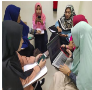
Figure 2. The process of discussing online material