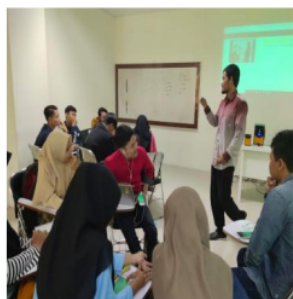
Figure 1. The Process of teaching in class