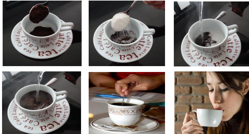
Figure 2. Procedure How to Make a Cup of Coffee

Teacher : Yes, you are right. Good. Procedure text tells about some steps in doing something in sequence. Now, I'm going to show you some pictures. Lets', see the pictures! (Show the picture a cup of coffee). Students : Okey, mam.