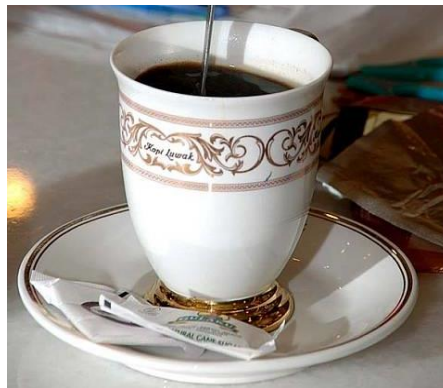
Figure 1. The Cup of Coffee

The first observation was done on May 21, 2014. When the teacher came into the class she greeted the students first before the activities were started. This was aimed at making the students feel comfortable and built the relationship, and atmosphere in teaching-learning process. Then, she asked some questions about the topic that would be discussed together. She did it in order to make the students have more interest in the topic. Then, she showed the picture cup of coffee and asked to the students to tell step by step the process to make a cup of coffee. It is to make the students feel enjoy having the lesson the general structure and language features of a text. She led the students to understand of procedure text.