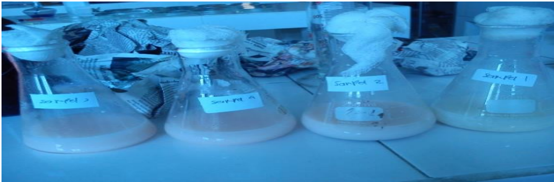
Pembuatan Suspensi (Pengenceran 10^{-1} )