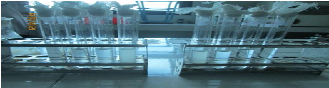
Pengenceran 10^{-2} sampai 10^{-5}