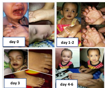
Figure 2. Clinical manifestation from day 0 admission until 6 days after treatment with IVIG (intravenous immunoglobulin) and aspirin.

Echocardiography patients on first confirmation (figure 1) had shown aneurysm right coronary supply route (7mm) and aneurysm of left coronary conduit (7mm) with all clinical sign dominantly high fever, The patient direct intravenous gamma globulin 22 gram (~2gram/kgbw) allowed in 12 hours single portion along with ibuprofen 200 mg (80mg/kgbw/day) orally, multiple times in day.