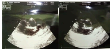
Figure 1. Aneurysm Right and Left Coronary Artery (R/LCA).

This case present a 3 years kid who went to the emergency clinic due to fever over 5 days following rash all over body, erythema and expanding in hands and feet, oral mucosal changes with erythema and breaking of lips, strawberry tongue and ensuing periungual desquamations, as of now patient sought treatment before with anti-infection agents yet not settled. No history of atopy in his family. Actual assessment showed the youngster looks sick, fever with erythema and breaking of lips, strawberry tongue, periungual desquamation. The history of redness and enlarging hands and feet previously vanished on the fifth day of fever. Given clinical, actual assessment, and history of ailment, the patient was determined to have Kawasaki Disease and a coronary blood vessel aneurysm.