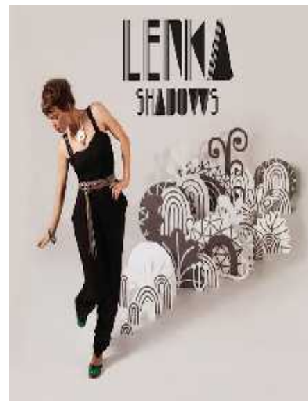
Shadows – Album