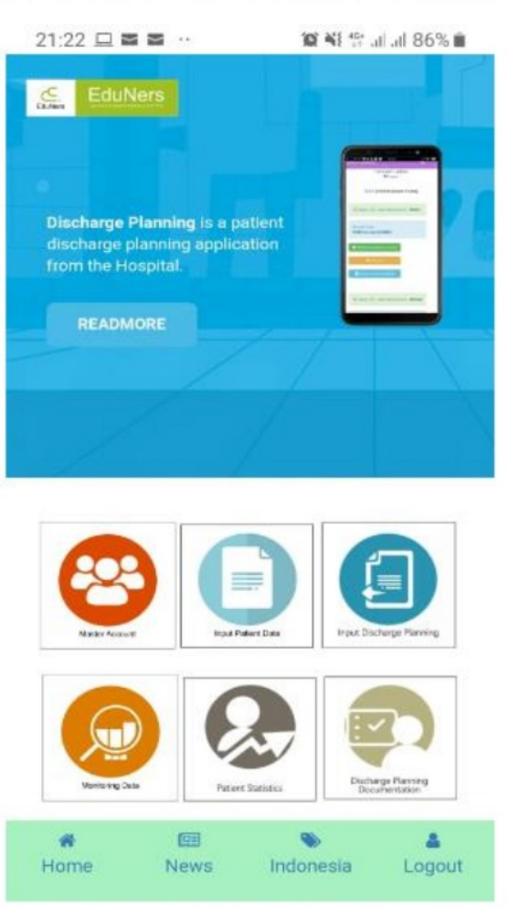
Figure 2. The nurse menu display of the discharge planning application

monitoring the medication plan include the name of the drug, the time to administer the drug, the intended use of the drug, the dosage, the side effects and the record of treatment. Inputs for monitoring the treatment plan, care plan include the type of treatment, care, date of administration, dose, and nurse records. Inputs for monitoring health education plan includes topics on health education, time of delivery and health education videos, and nurse's notes. Inputs for monitoring visits, control plan to hospitals include the date of re-visit, control, place, room, and parts of hospital, hospital name and nurse's note. Input for diet plans include monitoring dates, types of diet to be avoided, types of diet to consume, and treatment records. Figure 2 shows the nurses menu display of the application.