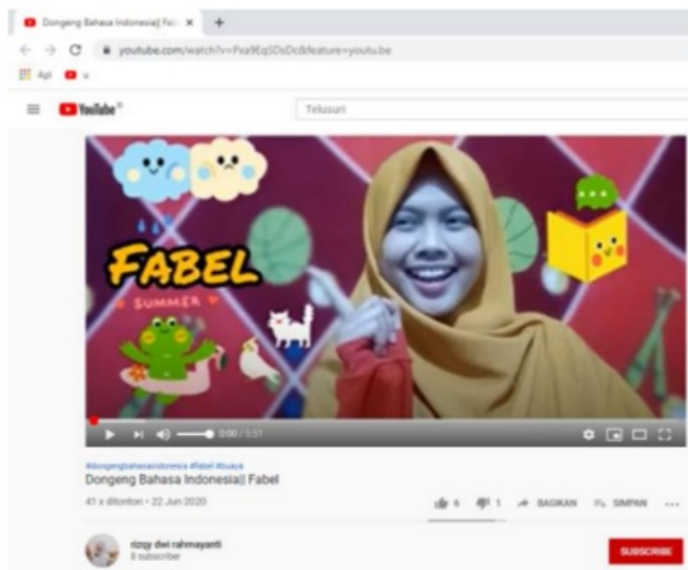
Figure 2. Indonesian Fairy Tale Learning Videos (Fables) by Universitas Muhammadiyah Surabaya Student in YouTube

We know that the Indonesian government began to explore the implementation of new normal after 3 months through the emergency response period and Large-Scale Social Restrictions. On May 26, 2020, the Minister of National Development Planning together with the Minister of Foreign Affairs, and the Expert Team for the Handling of the COVID-19 Task Force conducted a press conference to convey the productive and safe community protocol of COVID-19 towards a new normal, living side by side with COVID-19 (Muhyiddin, 2020). According to a politics lecturer in Universitas Gajah Mada, Sigit Pamungkas explained that new normal is a new way of life or a new way of carrying out life activities in the midst of an unfinished COVID-19 pandemic, new normal is needed to solve life problems during COVID-19 (Habibi, 2020).