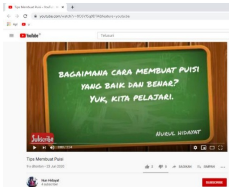
Figure 4. Learning Video about Tips on Making Poetry by Universitas Muhammadiyah Surabaya Students in YouTube

However, this is not perfect considering the immature preparation. As a result, lecturers have not directed students to learn certain video creation software applications; students still use various applications as in Table 3. That caused student abilities cannot be measured properly. In addition, based on the results of online interviews with several students, it is known that there are obstacles experienced by students when making learning videos to be uploaded on YouTube. They are students' lack of understanding related to the ratio of videos made, it causes the video which initially full screen turned to not full screen and the display looks unattractive. Misunderstanding in the operation of the application also becomes the biggest obstacle because some applications are only available for trial.