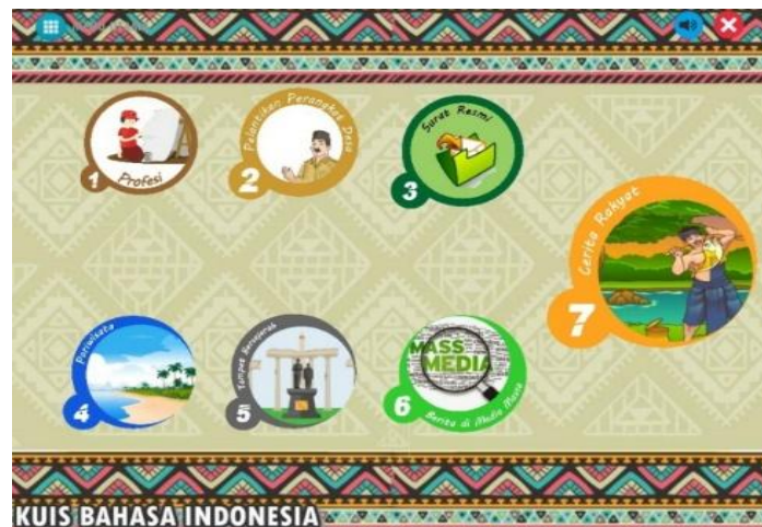
Figure 2. Display of the main menu after being revised

Validation results are used to improve/revise the assessment media (quiz) development. The results of the validation in the form of suggestions, among others from the material expert validator (1) improve the dots writing in the question; (2) add a list of difficult vocabulary words in the reading; (3) add the title above the reading; (4) include sources of images and text; (5) replacing news icons in the mass media; (5) and equalize the size of each theme icon. Suggestions from media expert validators (1) reading, layout, and font size should be equated to be consistent; (2) minimize the back and forth buttons and move their position down; (3) minimize the Points and Results box; and (4) adding pictures to the cover of the story. While the user validator recommends changing the reading theme buttons with more interesting icons so that the appearance of the media does not seem rigid. Here are some views of media assessment (quiz) based on Adobe Flash CC 2015 after being revised.