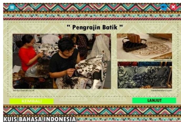
Figure 4. Display the back and forth buttons and points box and the results after revision and the use of dots on the question after revision

This interactive media quiz was developed through six stages. In detail these stages include: (1) the problem analysis stage, at this stage, the researcher conducts interviews and discussions with BIPA instructors. From the discussion, it can be seen that learning to reading comprehension is very important, but the media used to measure the success of reading comprehension does not yet exist, so that assessment media are needed to help the process of assessing reading comprehension of BIPA students; (2) product design, at this stage, the researcher creates an Indonesian language flowchart quiz; (3) the production of products begins with the collection of reading material that has the nuances of local wisdom, collects pictures of reading support, formulates questions, and composes answer keys. Local wisdom is taken as a material character because local wisdom can be used as a medium for the introduction of local culture for BIPA students (medium students of Indonesian language for Foreigner). (Yolferi., 2018). Meanwhile, (Rahim, Abd. Rahman. 2018) states that almost all local values including local wisdom values can be used as source or inspiration to enrich the development of life values that are needed by students as a means of living in learning in Indonesian society.