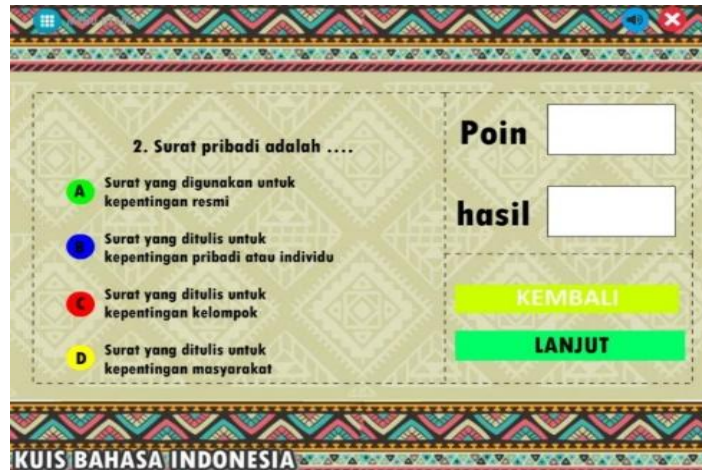
Figure 3. Source Addition, dan Image on reading cover