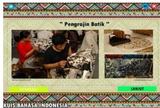
Figure 4. Display the back and forth buttons and points box and the results after revision and the use of dots on the question after revision

This interactive media quiz was developed through six stages. In detail these stages include: (1) the problem analysis stage, at this stage, the researcher conducts interviews and discussions with BIPA instructors. From the discussion, it can be seen that learning to reading comprehension is very important, but the media used to measure the success of reading comprehension does not yet exist, so that assessment media are needed to help the process of assessing reading comprehension of BIPA students; (2) product design, at this stage, the researcher creates an Indonesian language flowchart quiz; (3) the production of products begins with the collection of reading material that has the nuances of local wisdom, collects pictures of reading support, formulates questions, and composes answer keys. Local wisdom is taken as a material character because local wisdom can be used as a medium for the introduction of local culture for BIPA students (medium students of Indonesian language for Foreigner). (Yolferi., 2018). Meanwhile, (Rahim, Abd. Rahman. 2018) states that almost all local values including local wisdom values can be used as source or inspiration to enrich the development of life values that are needed by students as a means of living in learning in Indonesian society.