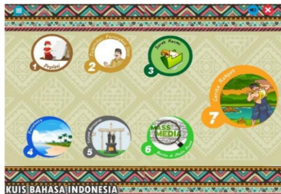
Figure 2. Display of the main menu after being revised

Validation results are used to improve/revise the assessment media (quiz) development. The results of the validation in the form of suggestions, among others from the material expert validator (1) improve the dots writing in the question; (2) add a list of difficult vocabulary words in the reading; (3) add the title above the reading; (4) include sources of images and text; (5) replacing news icons in the mass media; (5) and equalize the size of each theme icon. Suggestions from media expert validators (1) reading, layout, and font size should be equated to be consistent; (2) minimize the back and forth buttons and move their position down; (3) minimize the Points and Results box; and (4) adding pictures to the cover of the story. While the user validator recommends changing the reading theme buttons with more interesting icons so that the appearance of the media does not seem rigid. Here are some views of media assessment (quiz) based on Adobe Flash CC 2015 after being revised.