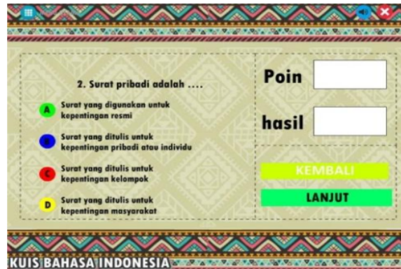
Figure 3. Source Addition, dan Image on reading cover