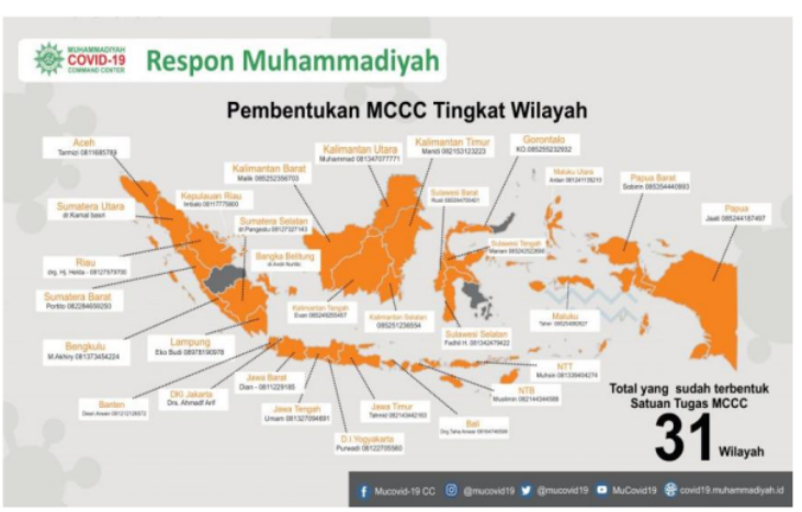
Figure 1. Muhammadiyah Responses, Source: <a href="https://covid19.muhammadiyah.id/tentang-kami/">https://covid19.muhammadiyah.id/tentang-kami/</a>, Access 20th October 2020

In the implementation of the work carried out, MCCC does not go alone, MCCC consists of the following elements: the Public Health Advisory Council (MPKU); Muhammadiyah Disaster Management Center (MDMC); 'Aisyiyah; LAZISMU; Council of Higher Education and Research Development (DIKTI LITBANG); Elementary and Secondary Education Council (DIKDASMEN); Tabligh Council; Muhammadiyah Student Association (IPM); Muhammadiyah Student Association (IMM); Nasyiatul 'Aisyiyah (NA); Hizbul Wathan (HW); Tapak Suci Putera Muhammadiyah (TSPM), as well as; Muhammadiyah Youth. This synergy from the central, regional, regional, branch to branch levels confirms that the MCCC's position is very ready and authoritative in tackling the spread of Covid-19 to the grassroots (MCCC, 2020b).