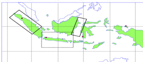
Picture : Indonesian Air Defense Identification Zone

Source: http://angkasena.blogspot.com/2008/05/air-defence-identification-zone-adiz.html