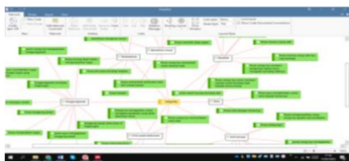
Figure 4. Integrity Network

Based on the integrity character education instrument, 63 quotes were summarized from interviews with teachers, students, and parents which are presented in the following network distribution: