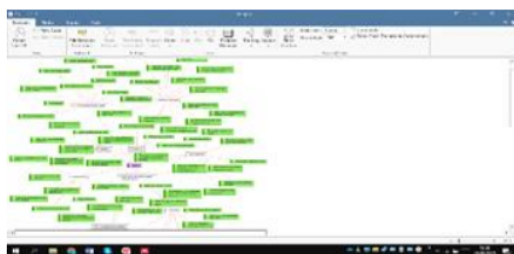
Figure 2. Religious Network

Based on the religious character education instrument, 84 quotes were summarized from interviews with teachers, students and parents, which are presented in the following network distribution: