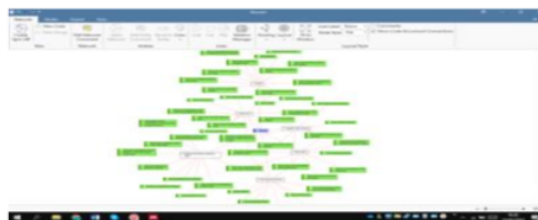
Figure 3. Independent Network

Based on the independent character education instrument, 58 quotes were summarized from interviews with teachers, students, and parents which are presented in the following network distribution: