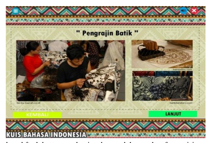
Figure 4. Display the back and forth buttons and points box and the results after revision and the use of dots on the question after revision

This interactive media quiz was developed through six stages. In detail these stages include: (1) the problem analysis stage, at this stage, the researcher conducts interviews and discussions with BIPA instructors. From the discussion, it can be seen that learning to reading comprehension is very important, but the media used to measure the success of reading comprehension does not yet exist, so that assessment media are needed to help the process of assessing reading comprehension of BIPA students; (2) product design, at this stage, the researcher creates an Indonesian language flowchart quiz; (3) the production of products begins with the collection of reading material that has the nuances of local wisdom, collects pictures of reading support, formulates questions, and composes answer keys. Local wisdom is taken as a material character because local wisdom can be used as a medium for the introduction of local culture for BIPA students (medium students of Indonesian language for Foreigner). (Yolferi., 2018). Meanwhile, (Rahim, Abd. Rahman. 2018) states that almost all local values including local wisdom values can be used as source or inspiration to enrich the development of life values that are needed by students as a means of living in learning in Indonesian society.