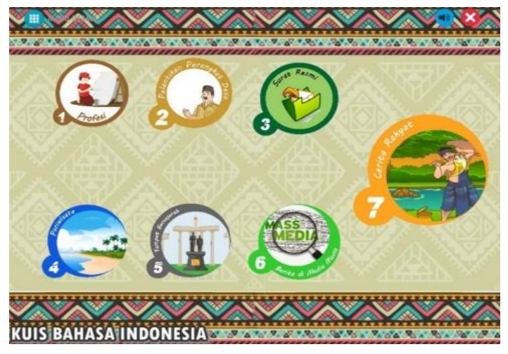
Figure 2. Display of the main menu after being revised

Validation results are used to improve/revise the assessment media (quiz) development. The results of the validation in the form of suggestions, among others from the material expert validator (1) improve the dots writing in the question; (2) add a list of difficult vocabulary words in the reading; (3) add the title above the reading; (4) include sources of images and text; (5) replacing news icons in the mass media; (5) and equalize the size of each theme icon. Suggestions from media expert validators (1) reading, layout, and font size should be equated to be consistent; (2) minimize the back and forth buttons and move their position down; (3) minimize the Points and Results box; and (4) adding pictures to the cover of the story. While the user validator recommends changing the reading theme buttons with more interesting icons so that the appearance of the media does not seem rigid. Here are some views of media assessment (quiz) based on Adobe Flash CC 2015 after being revised.