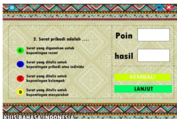
Figure 3. Source Addition, dan Image on reading cover