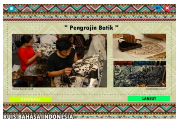
Figure 4. Display the back and forth buttons and points box and the results after revision and the use of dots on the question after revision

This interactive media quiz was developed through six stages. In detail these stages include: (1) the problem analysis stage, at this stage, the researcher conducts interviews and discussions with BIPA instructors. From the discussion, it can be seen that learning to reading comprehension is very important, but the media used to measure the success of reading comprehension does not yet exist, so that assessment media are needed to help the process of assessing reading comprehension of BIPA students; (2) product design, at this stage, the researcher creates an Indonesian language flowchart quiz; (3) the production of products begins with the collection of reading material that has the nuances of local wisdom, collects pictures of reading support, formulates questions, and composes answer keys. Local wisdom is taken as a material character because local wisdom can be used as a medium for the introduction of local culture for BIPA students (medium students of Indonesian language for Foreigner). (Yolferi., 2018). Meanwhile, (Rahim, Abd. Rahman, 2018) states that almost all local values including local wisdom values can be used as source or inspiration to enrich the development of life values that are needed by students as a means of living in Indonesian society.