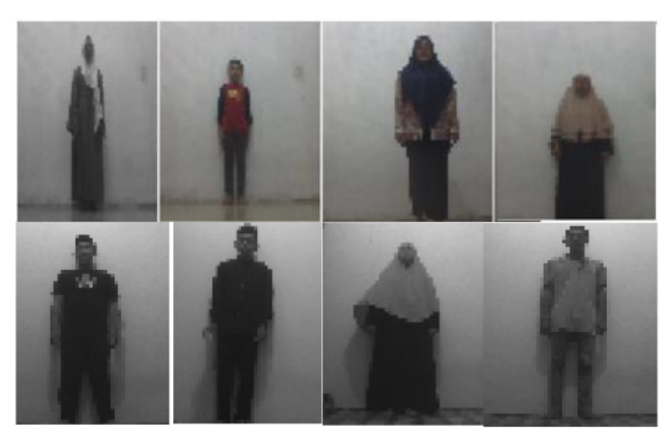
Figure 3. Several Body Height that Have Been Collected