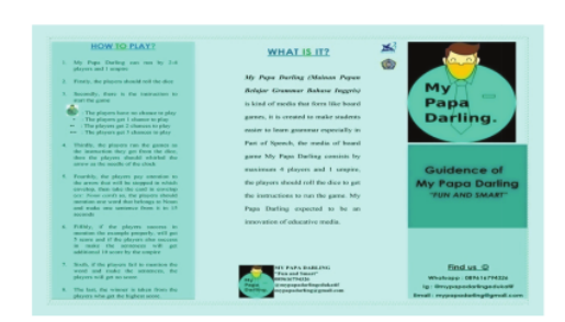
Figure 4: Design of My Papa Darling Guidance.

My Papa Darling is equipped with a guidance paper which contains about the rules and steps to run the games.