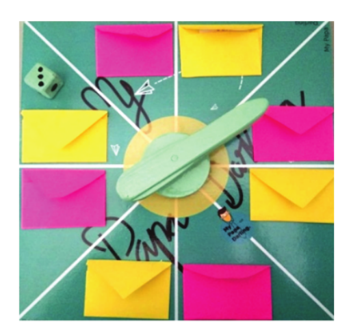
Figure 3: First Prototype of My Papa Darling.