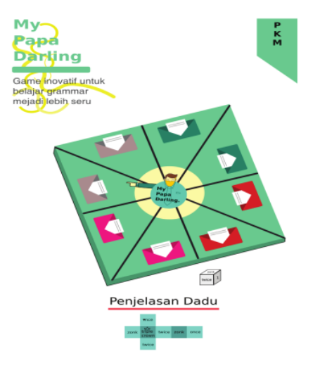
Figure 2: Design of Product My Papa Darling.

My Papa Darling (Mainan Papan Belajar Grammar Bahasa Inggris) is a kind of media formed like board games, it is created to make students get easier to learn grammar especially in Part of Speech namely noun, pronoun, verb, adverb, adjective, preposition, conjunction, and interjection. 'My Papa Darling' can be played by 4 players and 1 umpire, the players should roll the dice to get the instruction to run the game. The design of 'My Papa Darling' is as follows: