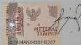
Novita Nida Azzahra

Surabaya, 14 Agustus 2023 Yang membuat Pernyataan,