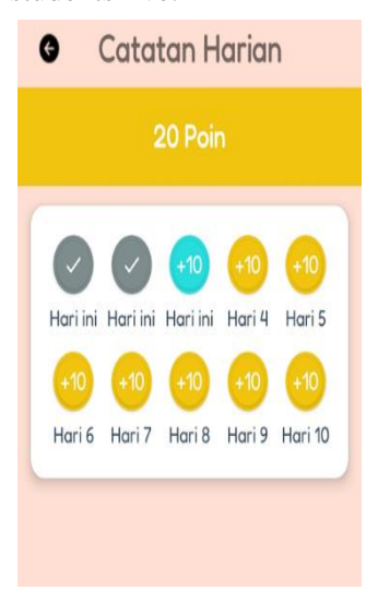
Fig 5. Daily record component on daily project based learning

This development component is very relevant to the characteristics of the project-based learning model [12]. Project-Based Learning is a way of learning by using problems as a step in integrating new knowledge based on experience in real activities. Project-Based Learning is designed to facilitate students to carry out investigations using complex problems. Meanwhile, the addition of daily terminology is the development of project-based learning that has a contextual concept with student activities every day. Meena and Alison [13]. Also stated that Eco literacy is not only limited to knowledge of ecological concepts, but also about the ecosystem in which students live.