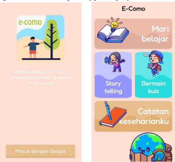
Fig 1. Design interface of E-Como, an environment-based mobile digital learning module

The design phase is carried out to design learning plan activities, design material to be displayed in digital form, and design prototypes of digital mobile modules. At this stage the features used in the development of this module were also designed, such as the application of material content features, pictorial and audio storytelling, quizzes, and daily projects. Taking quizzes that are packaged with obtaining scores becomes more interactive, this has the potential to increase user results compared to taking quizzes using textbooks (Pinoa, 2021). Figure 1 shows the prototype display of the mobile digital module.