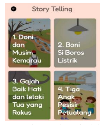
Fig 3. Story telling menu in mobile digital module

The children's story component in this digital module is also a distinct advantage. This component contains a feature called storytelling, containing nine (9) titles of ecologically conscious children's stories accompanied by illustrations and audio.