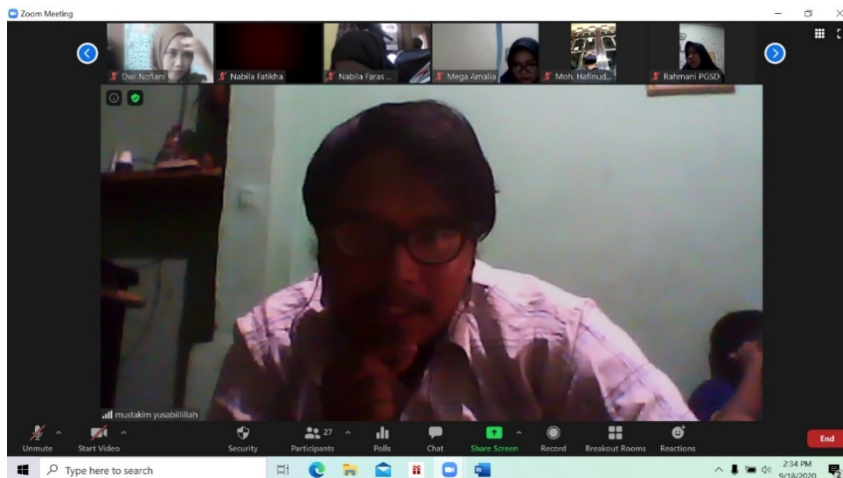
Figure 3. Discussion the problem solving

The ability to solve problems is needed by someone to achieve certain goals and to find solutions. A student has a duty to become an individual who always carries out positive activities such as discussing, studying, expressing arguments during deliberations or presentations, asking questions, bringing up various innovations, developing creativity, critical thinking, and good time management appropriately. When students can do this, they will be able to solve the problems they face well. Based on the results of the study, it shows that the implementation of online learning can improve students' ability to solve problems. This happens because online learning activities through zoom meetings emphasize the interaction and channeling of information that makes it easier for students to improve the quality of their learning. In online learning using zoom meetings, frequent discussions are held which requires students to be actively involved in asking, answering, and arguing on the issues being discussed.