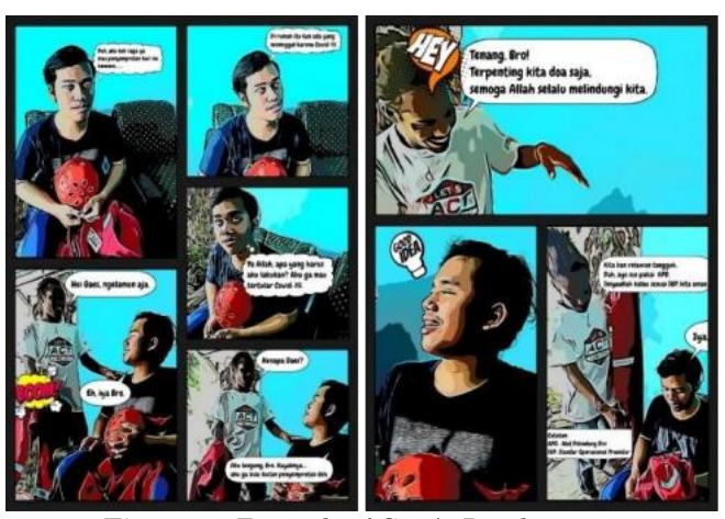
Figure 2: Example of Comic Development.