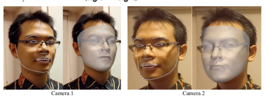
Fig. 3. "True Person" example has different landmarks from Camera 1 and 2

These two contrasting scenarios were instrumental in rigorously evaluating the system's capabilities. The spoofing simulation provided insights into the system's resilience against fraudulent access attempts, while the authentic user login simulation gauged its effectiveness in correctly identifying and granting access to legitimate users. These scenarios offered a comprehensive evaluation of the system's overall performance, encapsulating both its defensive robustness against security threats and its operational efficacy in user verification ( Fig. 3 and Fig. 4 ).