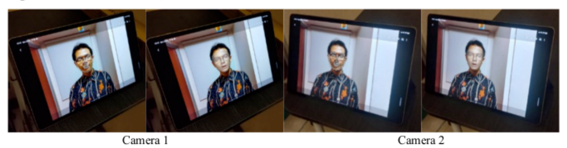
Fig. 4. "Fake Person" example has the same landmarks from both Camera 1 and 2, indicating a spoof attack