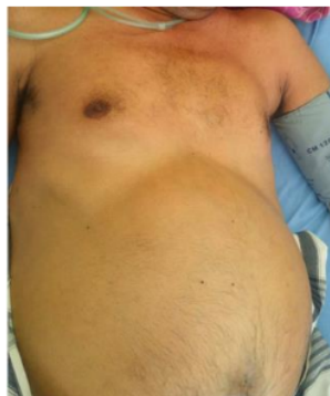
Figure 1. Physical examination exhibiting abdominal distension without chronic liver disease stigmata

The physical examination in Surabaya showed weak state and GCS 4/5. Blood pressure 130/90 mmHg, heart rate 110 bpm regular, respiratory rate 22 times/minutes, temperature of axilla 36,2°C, capillary refill time less than 2 seconds, oxygen saturation 97% without oxygen support (98-99% with nasal cannula 4 liters/minute). From physical examination, a mass in right hypochondriac region reaching the epigastric region was palpable ( Figure 1 ). Chronic liver disease stigmata such as spider angioma, jaundice, palmar erythema, gynecomastia, and ascites were not found. The laboratory result is shown in Table 1 . Thorax photo discovered normal lungs and heart with no signs of metastatic in lungs and bones. The patient brought abdominal USG 4 months prior to current admission. The USG showed enlarged left lobe with solid and bobbing mass 68,2 x 69,3 mm and multiple solid nodule in its surrounding. The CT scan done in Surabaya exhibited enlarged liver size with heterogeneous parenchyma density; solid mass in right lobe 7,9 x 14,2 cm and solid mass in left lobe 16,4 x 22,4 cm with positive infiltration; normal biliary duct; and thickening of right and left pleura. It suggested hepatocellular carcinoma on right and left lobes with no thrombus portal and minimal bilateral pleural effusion ( Figure 2 ).