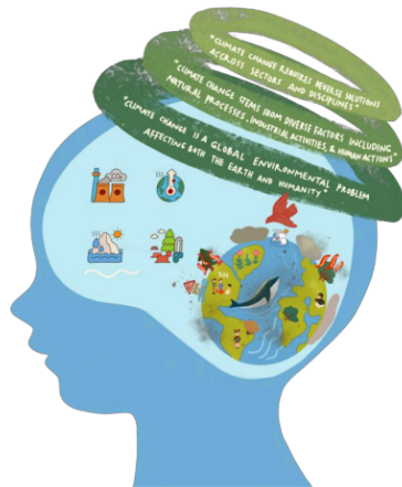
Figure 1 shows three types of perspectives on climate change held by the pre-service English teachers. Firstly, they predominantly viewed climate change as a substantial global environmental challenge affecting both the Earth and humanity. For instance, SS2 stated that climate change had significant adverse impacts on both the Earth and humans, and hence, attempts to address climate change were necessary. SS6 opined that climate change was a global environmental issue primarily caused by human activities, leading to natural disasters.

Pre-service English Teachers' Perspectives on Climate Change