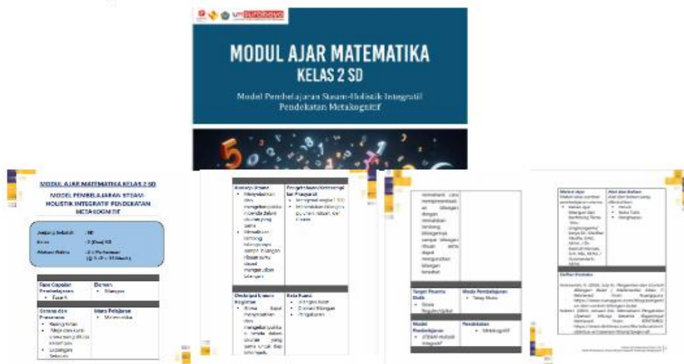
Teaching Module for Grade 2 Mathematics