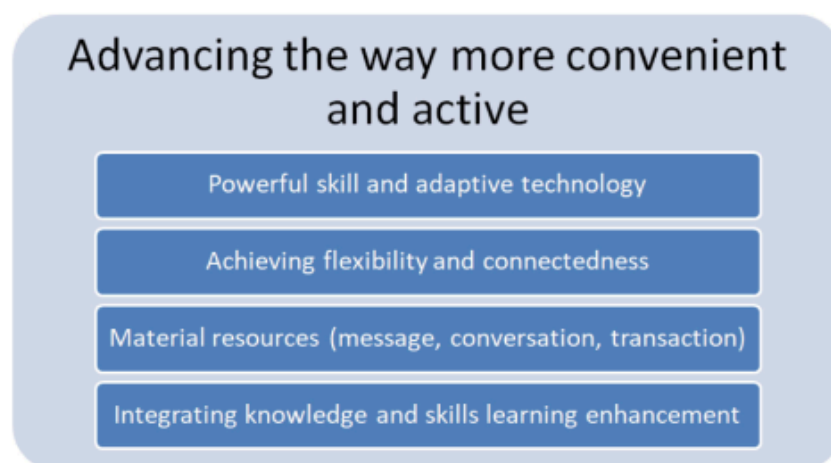
Fig. 2. Big Data Emerging Technology in Supporting Resources for Online Learning (Huda et al., 2018).

In accordance with selecting the approach utilized in educational guidance, the following improvement in how to enhance performance can help boost academic success and support students' growth in improving overall interaction within the learning process [46, 47]. Trying to actively involve the learning style in the instructional process in order to enhance thinking skills ultimately involves increasing confidence to elevate learning enhancement skills. Utilizing new big data technology and actively showcasing knowledge and skills is essential for achieving flexibility and connectivity with powerful skills and adaptive technology [48, 49] (Fig. 2).