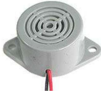
Figure 6. Buzzer