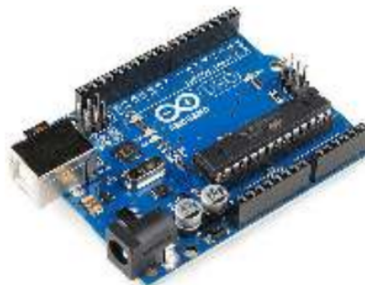
Figure 2. Arduino Uno

Arduino Uno is an ATmega328 based microcontroller board (datasheet). It has 14 pin input from digital output where 6 pin input can be used as PWM output and 6 pin analog input, 16 MHz crystal oscillator, USB connection, power jack, ICSP header, and reset button. To support the microcontroller in order to use, simply connect only the Arduino Uno Board to the computer using a USB or power cord with AC-to-DC adapter or battery to run it.