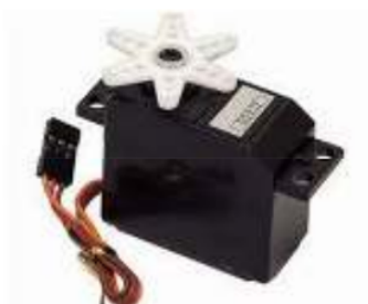
Figure 5. Motor Servo

A servo motor is a DC motor with a closed feedback system where the rotor position will be informed back to the control circuit that is in the servo motor. This motor consists of a DC motor, a series of gears, a potentiometer, and a control circuit.